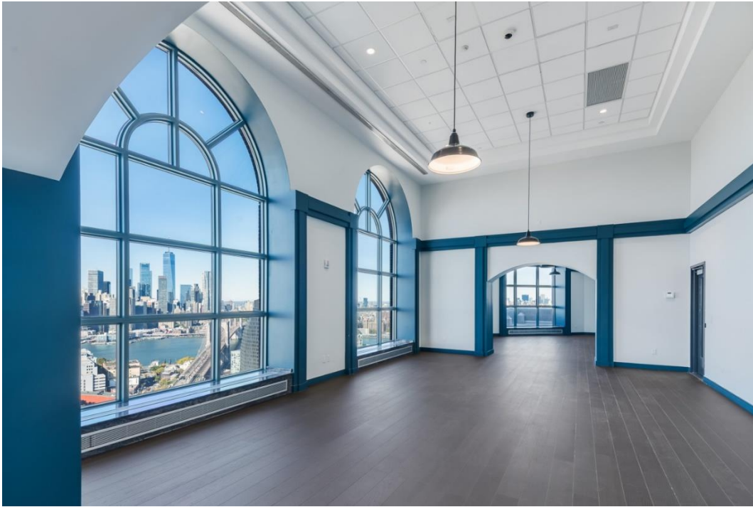
90 Sands, Brooklyn