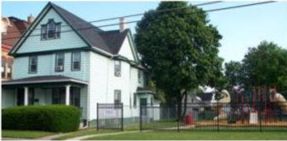
Clifford Avenue, Rochester