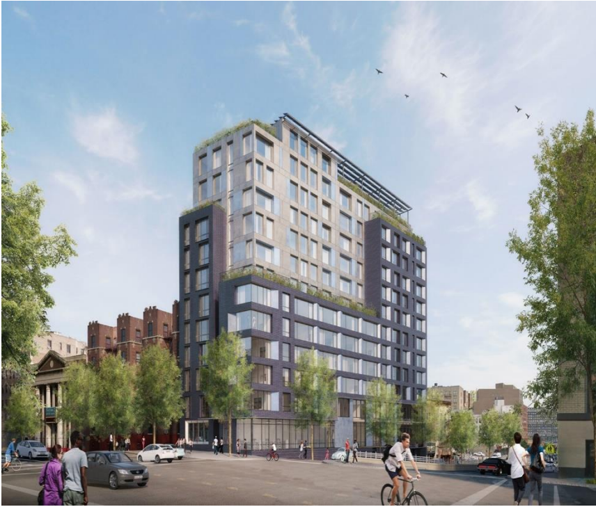
2050 Grand Concourse, Bronx