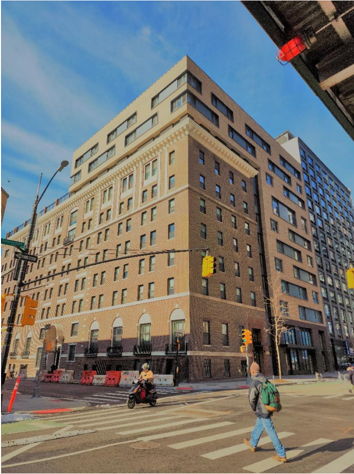
50 Nevins Street, Brooklyn